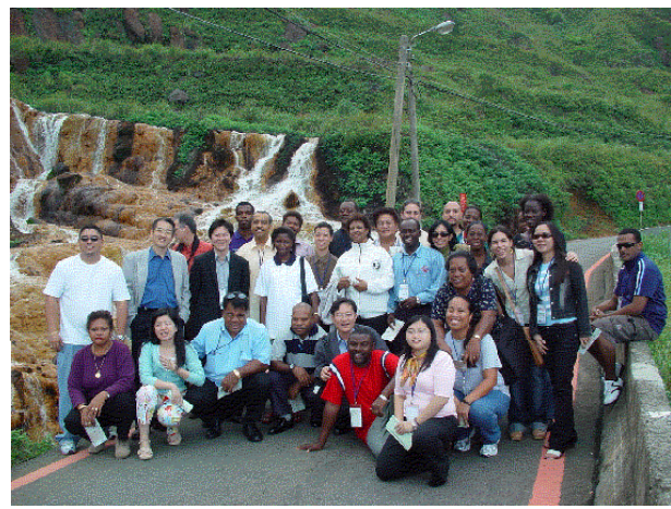
Pictured above: TaiwanICDF participants in a cultural tour in Gold Mountain- Taipei, Taiwan.

The workshop comprised of 28 participants from various countries throughout Africa, South America, South East Asia and the Pacific region. The topics covered an overall view of tourism promotion and community development within Taiwan with a primary focus on case studies of community development through establishment of tourism businesses.